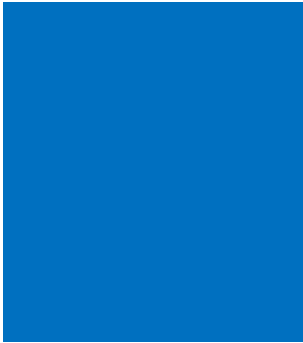
FULL PAGE $600 8 ½" x 11"